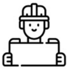
Engineering & Design